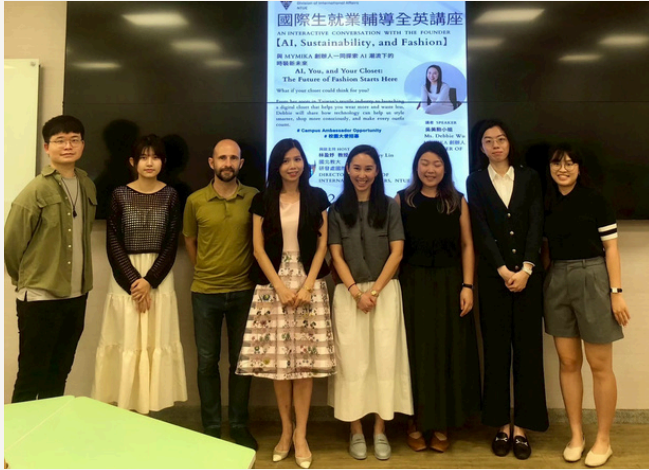
AI, You, and Your Closet